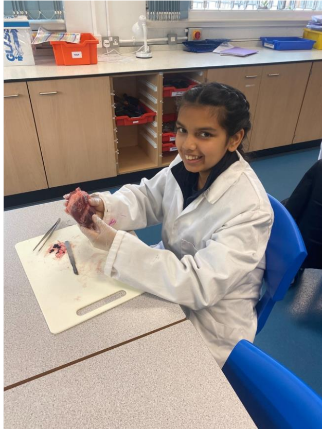
6 - Silver Award Winner