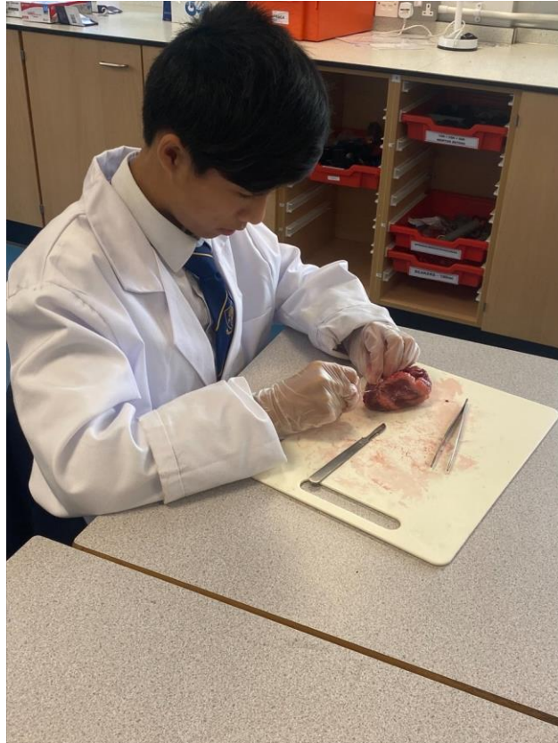
4 - Silver Award Winner