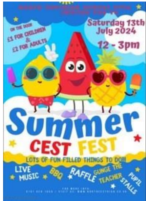
9 - Cest Fest 2024