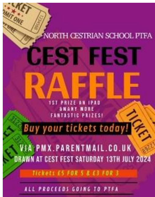
10 - Cest Fest 2024