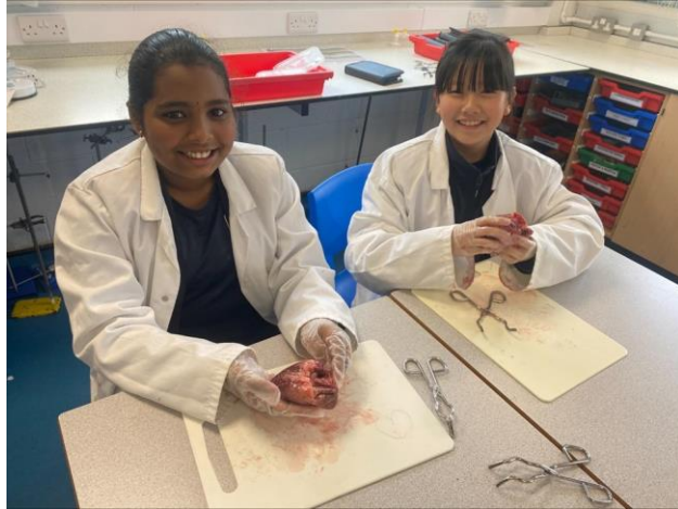
2 - Silver Award Winners