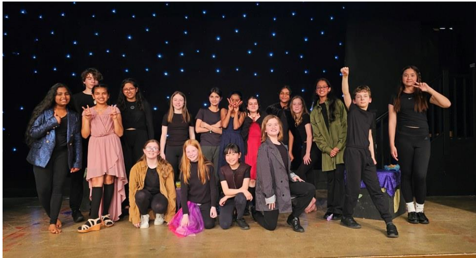
1 - Midsummer's Night Dream