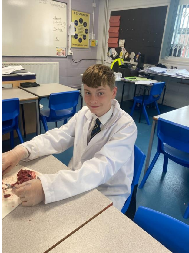
5 - Silver Award Winner