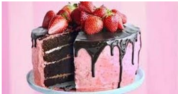
8 - Bake Off

You can drop off your cakes on Friday 12th July 2024 , and I will store in fridges in T3 or on the day itself, Saturday 13th July 2024 between 11am to 12noon