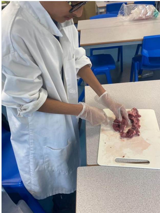
3 - Silver Award Winner