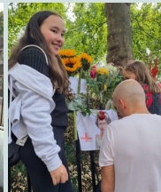
Cestrians Platinum Jubilee.