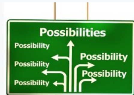
Key Stage 4 Option System for courses beginning September 2023