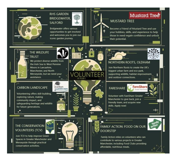
3 - Too see the full presentation with links to the opportunities - <u>Voluntary Work Community Service.pdf</u>

Second reminder to complete the parent voice: which clubs / societies / groups your child is part of beyond their school life. We could support their development by bringing those skills to the fore in school, by providing space to lead, and of course highlight the many and varied rich and fulfilling lives that might motivate others to follow you! Please complete this Form Questionnaire with some details.