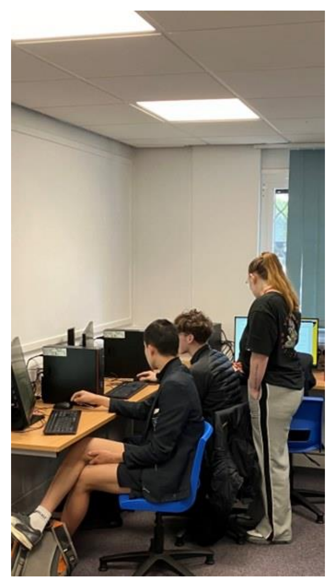
8 - ASK Session

We are planning on working with the ASK team over the coming years to support each year group and ensure that students are aware of the apprenticeship pathway and to also give the best support possible to students who would like to go down that pathway.