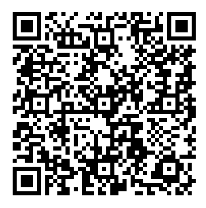
4 - QR CODE LINK TO THE questionnaire FOR EVERYONE!

MR CLIFFE ALREADY COLLECTS YOUR SPORTS CLUBS INFORMATION SO THINK BEYOND SPORT CLUBS IN THIS FORM QUESTIONNAIRE.