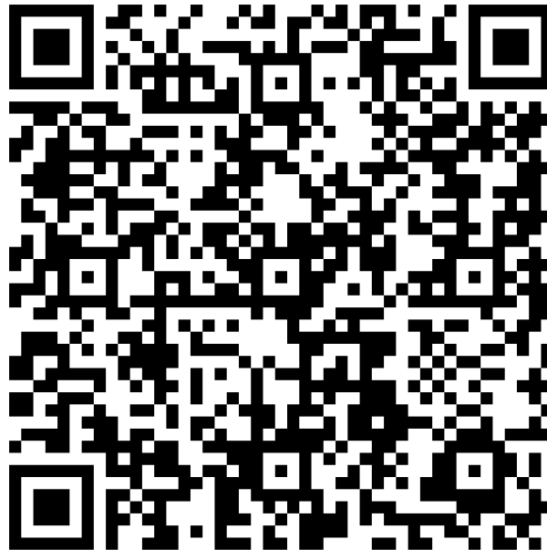
1 - QR CODE LINK TO THE questionnaire FOR EVERYONE!

MR CLIFFE ALREADY COLLECTS YOUR SPORTS CLUBS INFORMATION SO THINK BEYOND SPORT CLUBS IN THIS FORM QUESTIONNAIRE.