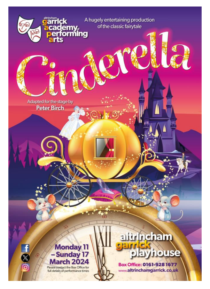
4 - Aidan F (Y8) is building many aspects of his character through his work with the Altrincham Garrick Theatre. So, if you would like to see the Cinderella show then check out the tickets here <u>Cinderella - A GAPA Spring Pantomime | Altrincham Garrick</u>. If you would like to get involved in any aspect of performance then please contact Aidan or the theatre, the is also voluntary work available - all great to build your character benchmarks with!