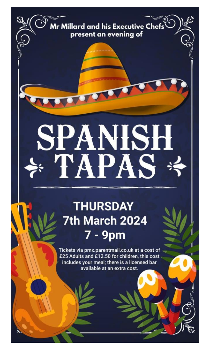
3 - Spanish Tapas - Hola!