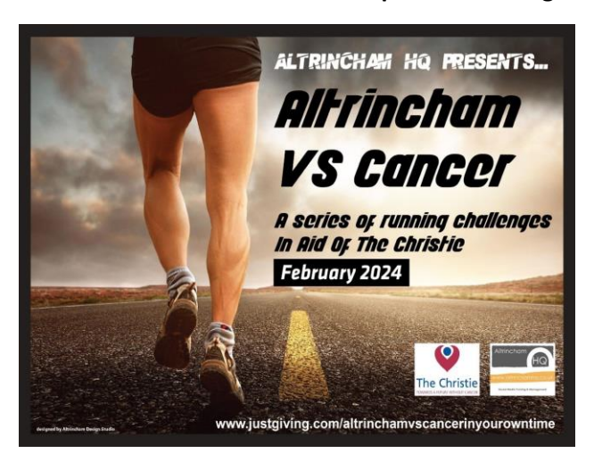
1 - When does purposeful meet generosity of spirit?

Date for your diary - Character Education at North Cestrian parents evening - Thursday 29th Feb, 7pm.