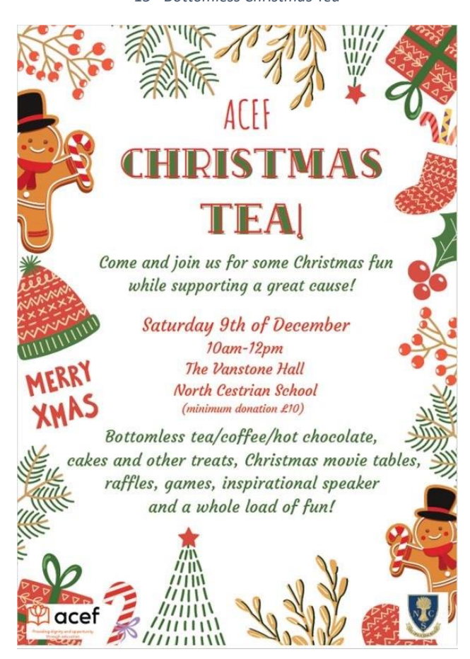
16 - Christmas Tea