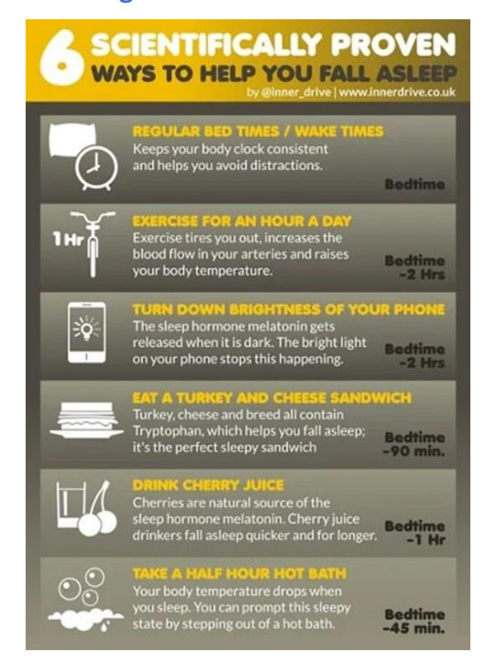
2 - Ways to fall asleep