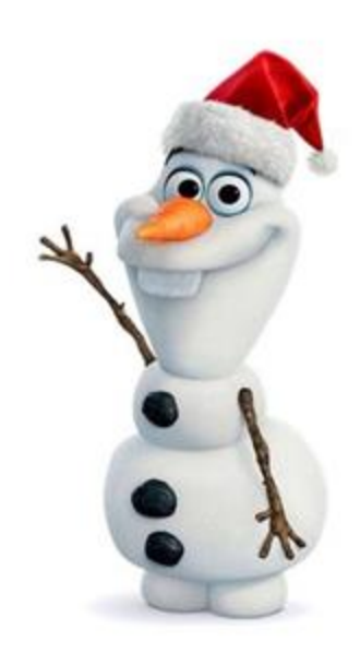
15 - Bottomless Christmas Tea