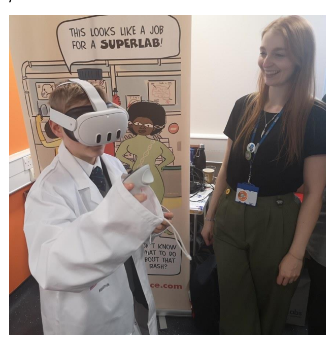
5 - Careers

On Wednesday a good number of our pupils visited a careers fair held at Manchester University, showcasing the vast range of career opportunities within the NHS. The range of options was impressive: from research in biochemistry, to mental health support, to midwifery, to orthopaedics, it was educational to see the infrastructure behind the nusring and medical interventions. The various stands were 'hands on' with children making use of ultrasound devices, testing sample in agar, experiencing plaster casts, and using virtual reality to train in laboratory work. Pupils were a credit to the school, were engaged the activities and took interest in the speakers. Big thank you to Mr Gallamore and Mrs Iqbal for helping to organise the day.