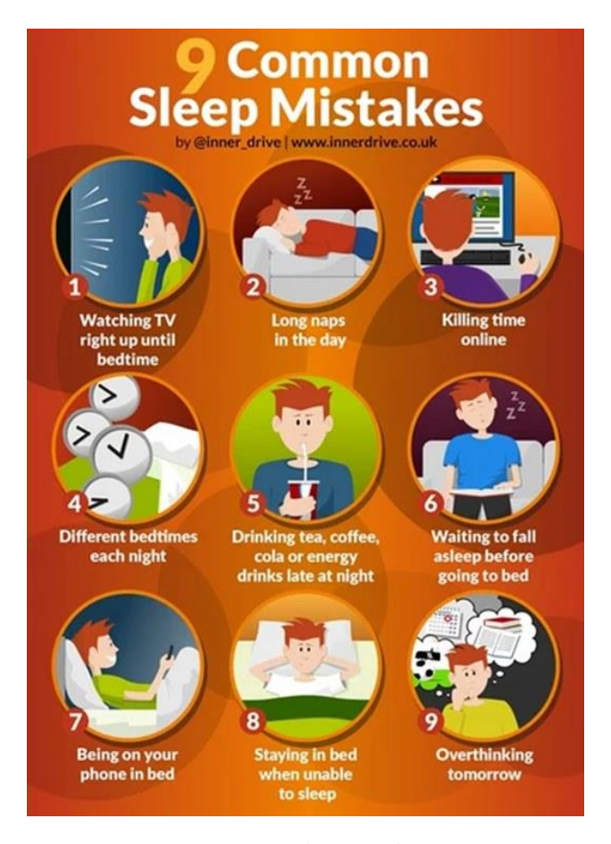
3 - Common sleep mistakes

Thanks again to our Cognitive Science Network Partners InnerDrive for this week's academic gems of wisdom relating to our Attitute to Learning development area - Focus.