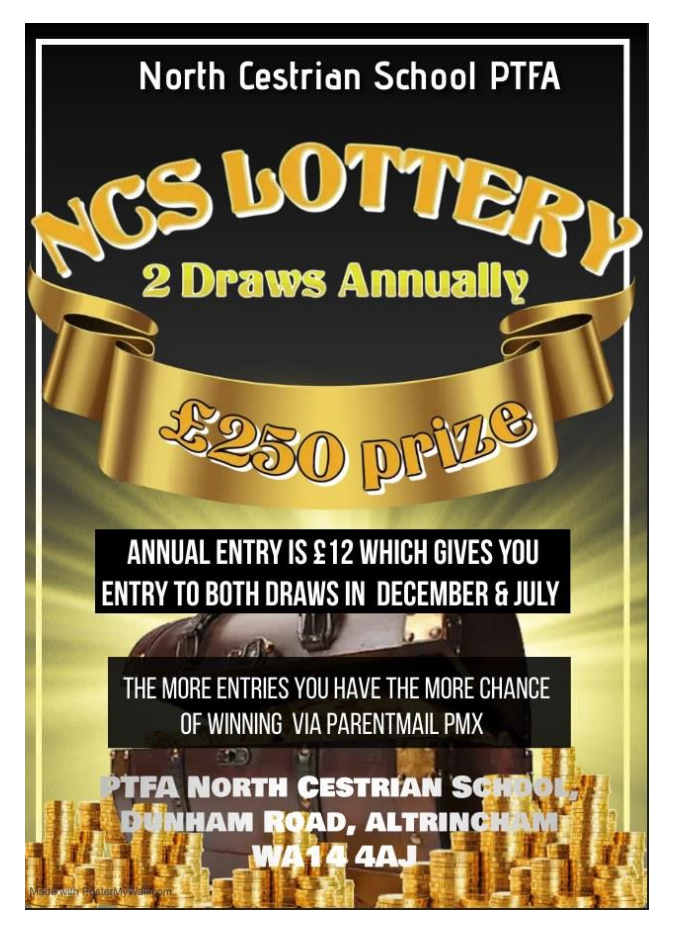
18 - NCS Lottery

Extra-Curricular Opportunities (activities available for all years unless stated)