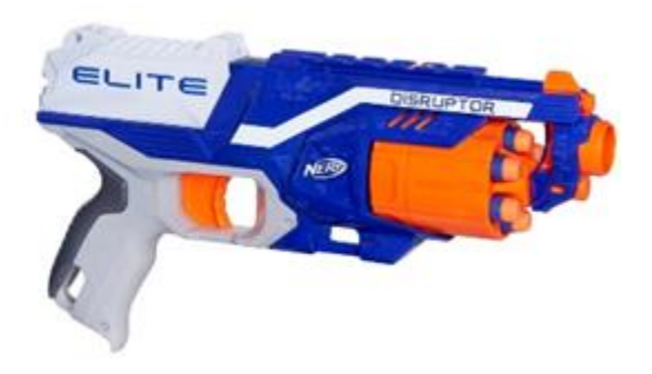
14 - Nerf Wars

Christmas Tea - £10 per person or £25 per family