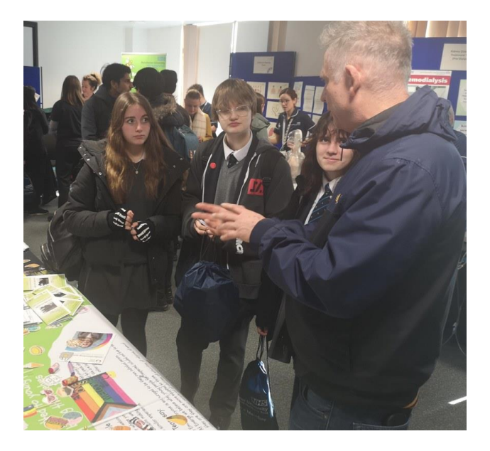
7 - Careers