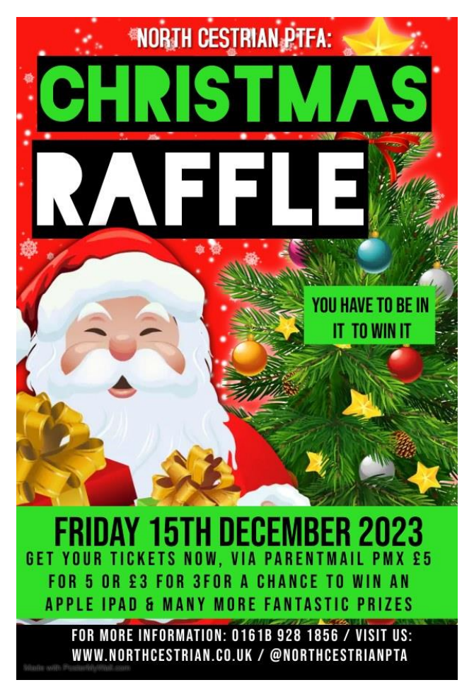
17 - Christmas Raffle 2023