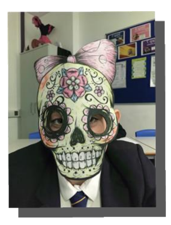
9 - La Catrina