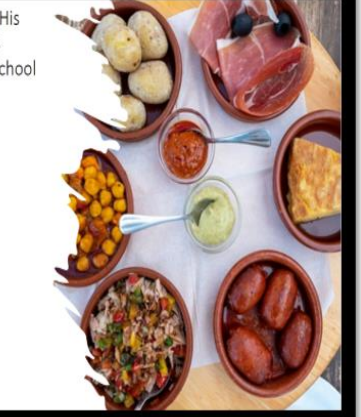
16 - Tapas Evening