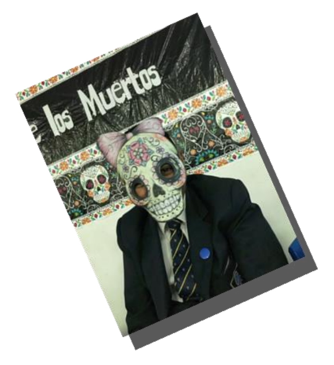
10 - La Catrina

North Cestrian Languages students have been studying about the wonderful South American traditions celebrating the lives of family members who have died. Languages classrooms have been decorated according to traditions. Here is a an example of the altar erected in Mexican homes—each item has symbolism. Our Year 9s should be able to share what each item represents, and below are some of the