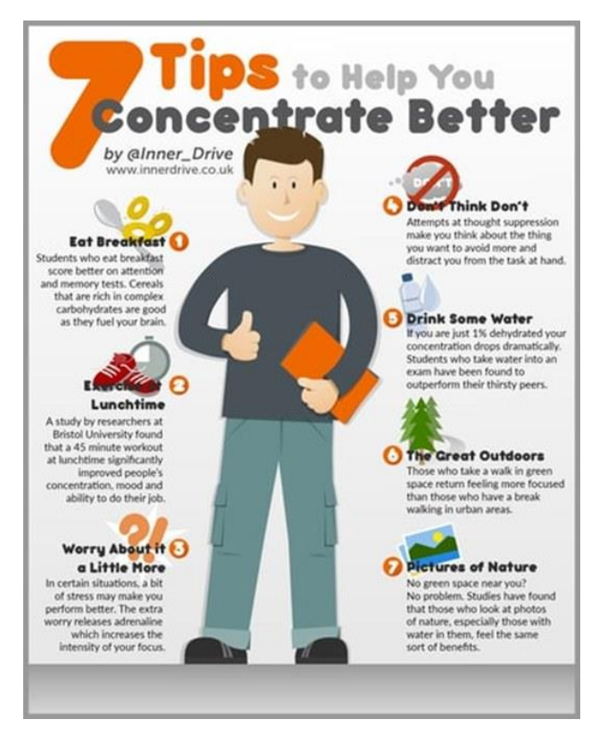
3 - Tips to improve Concentration

There are many reasons why students get distracted so easily and frequently. It's a combination of biological, psychological and environmental factors that all play a role.