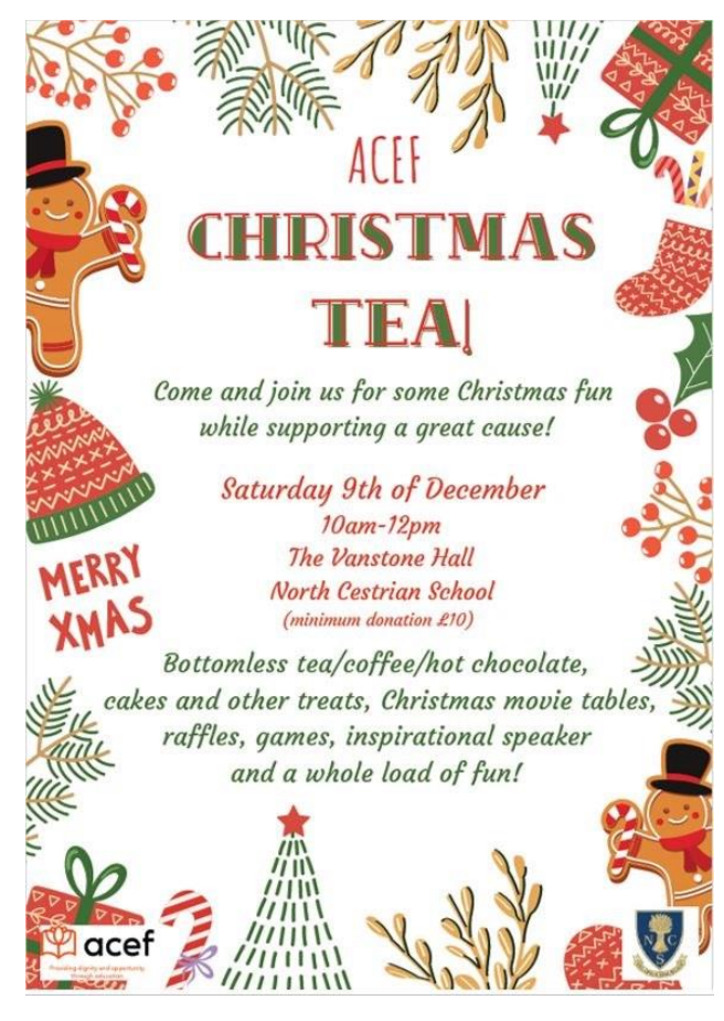
22 - Christmas Tea