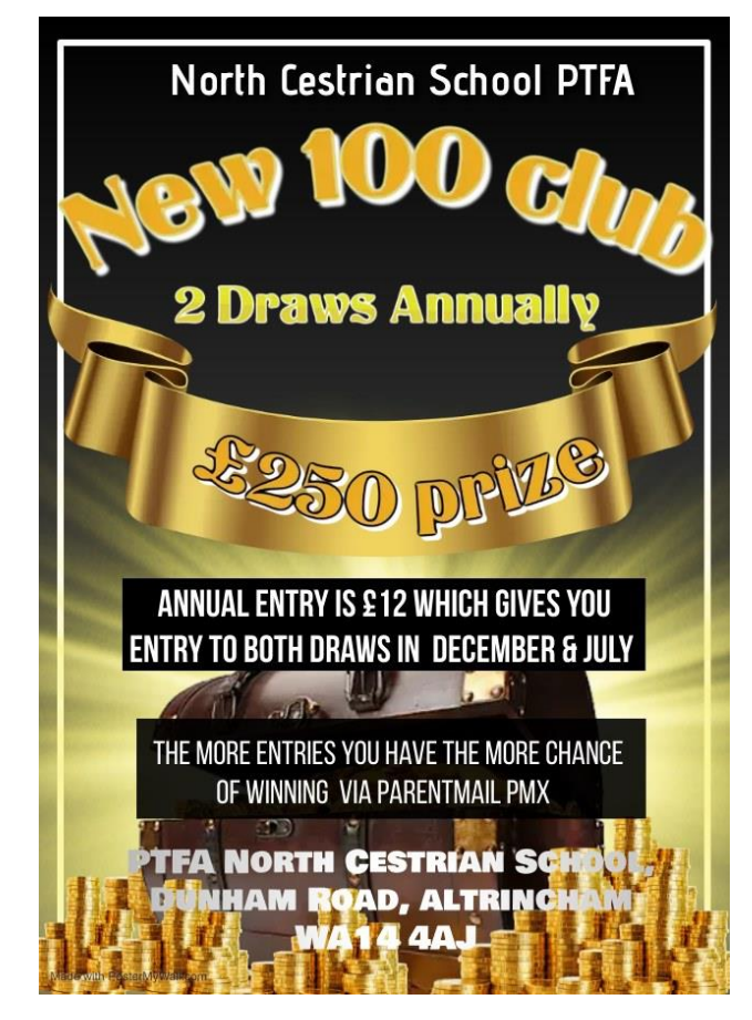
24 - 100 Club

Extra-Curricular Opportunities (activities available for all years unless stated)