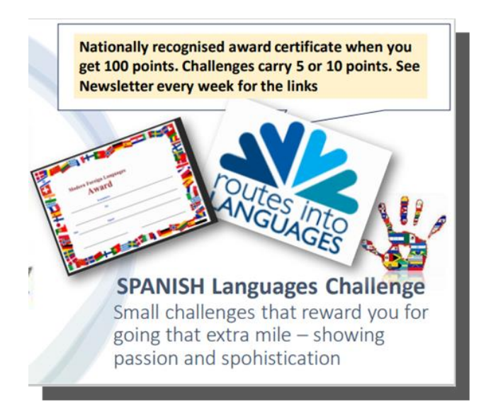
13 - Languages Challenge

It is a series of varied challenges and activities that our learners can take over time to widen their knowledge, increase their language awareness, and show excellent attitudes to learning.